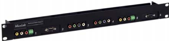
Fully loaded - front view