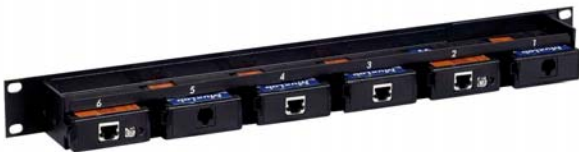
Fully loaded - rear view