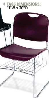
MODEL 8508 W/TAB5R AND BR85 The 8500 Series chair with the optional R/L Tablet and Book Rack