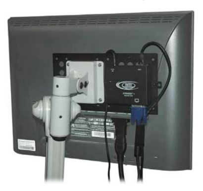
Remote unit mounted to the back of a flat panel monitor using ST-C5MK-VESA mounting kit