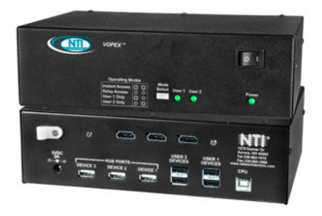
VOPEX-USBH-2 (Front & Back)

The VOPEX® HDMI/DVI USB KVM splitter with built-in USB hub allows up to four users (four USB keyboards, USB mice and DVI/HDMI monitors) to access one USB computer and up to three USB devices (printers, scanners, security cameras, etc.).