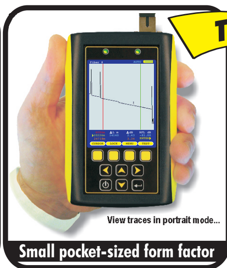
Small pocket-sized form factor