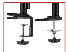
Clamp-on and grommet mount option

For wood or composite surfaces up to 3" (76mm) thick