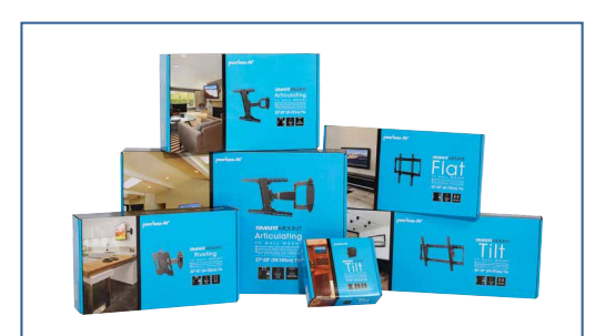
+15°/-5° of tilt for versatile viewing angles.