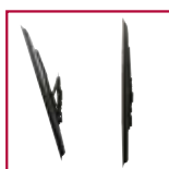
Low-profile design at 1" (25 mm) with tilt lock at 0°