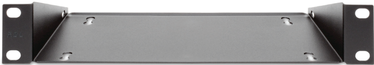
HR-HRA1 10.4" Rack Adapter