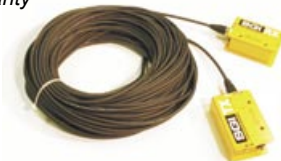
That's a lot of cable! No problem for the SGI