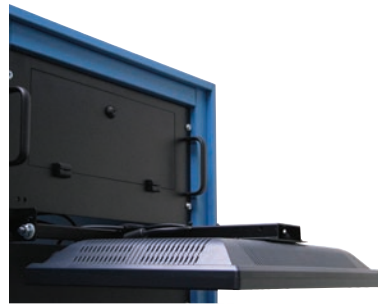
RMVM-100 Mounted so monitor tilts down.