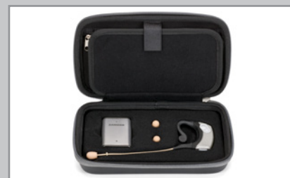
CARRY CASE INCLUDED