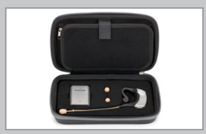
CARRY CASE INCLUDED