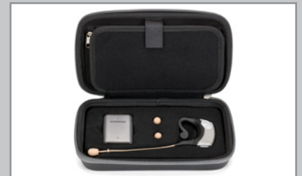
CARRY CASE INCLUDED