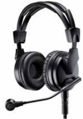
BRH50M Dual Sided Premium Broadcast Headset