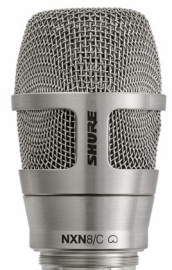
RPW202 Nexadyne 8/C Cardioid Dynamic Vocal Microphone Wireless Capsule for Shure Handheld Transmitters (Nickel)