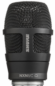
RPW200 Nexadyne 8/C Cardioid Dynamic Vocal Microphone Wireless Capsule for Shure Handheld Transmitters (Black)