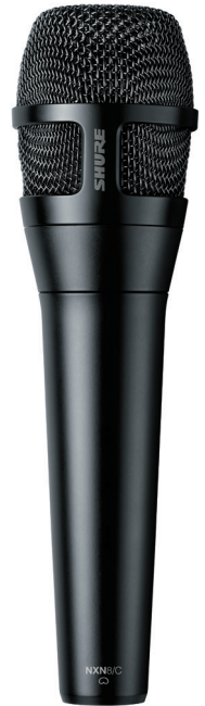
NXN8/C Nexadyne™ 8/C Cardioid Dynamic Vocal Microphone