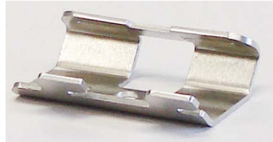
LD-IT LED Sign End Mounting Installation Tool.

The display mode and colour options are set-up using a separate remote control, the LD-RPC.