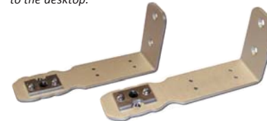
The LD-KC1 mounting kit.