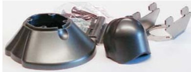
LD-KE1 End Mounting Kit For 40cm Or 20cm Flush Mounting Signs.

The sign is supplied as standard so that it can be mounted flush to a wall, e.g. for the 'TX' & 'REH' sign shown below. However, a mounting kit is available, LD-KE1, to mount the sign perpendicular to a wall, e.g. above a door, such as the ON AIR sign shown.