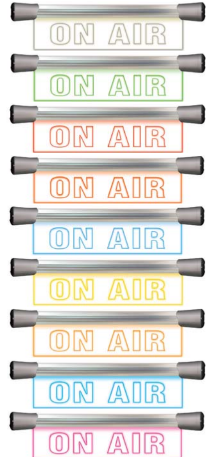
9 different colours of the SignalLED Sign.