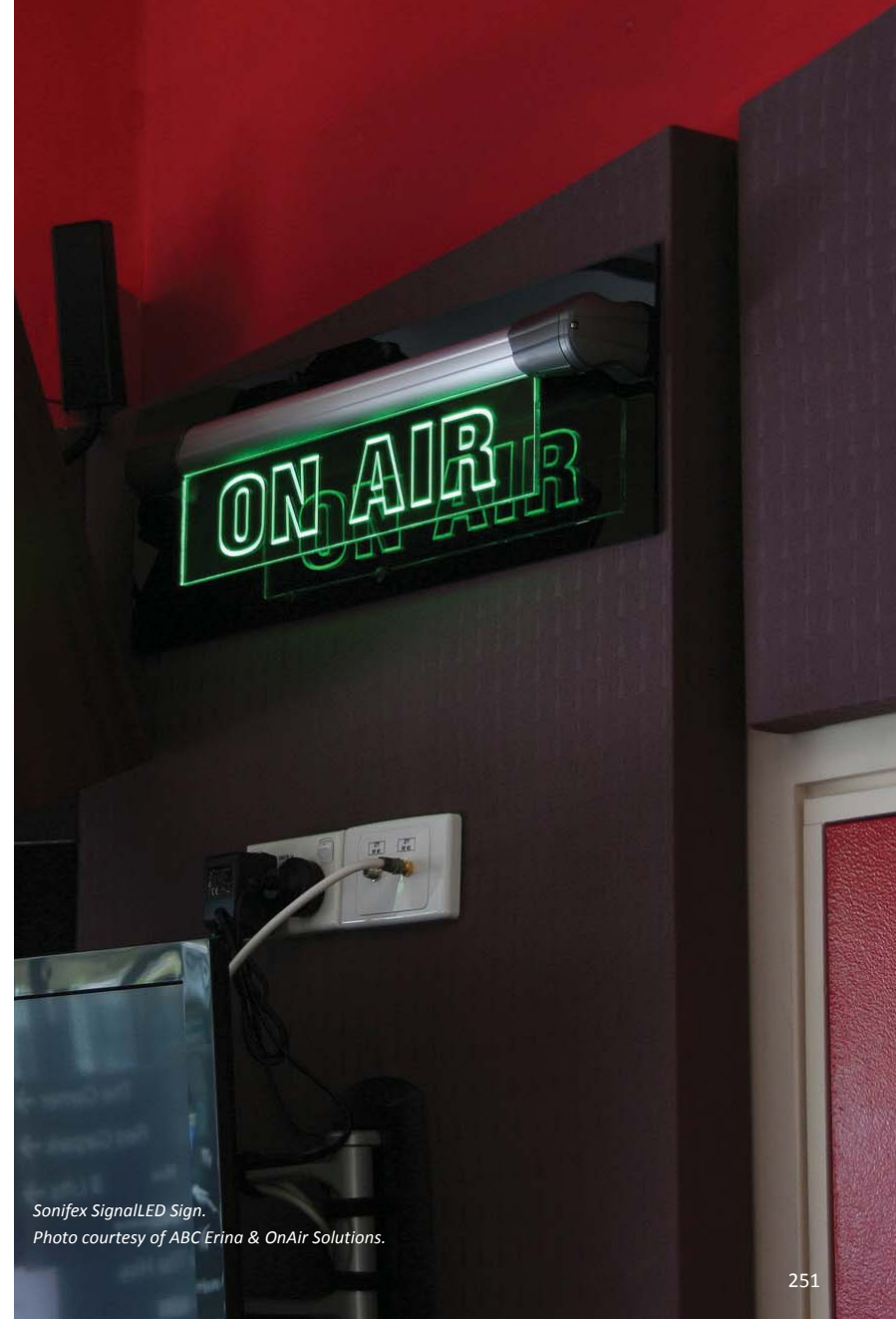
Sonifex SignalLED Sign.