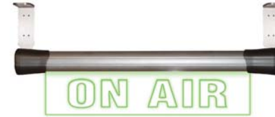
The LD-KC1 mounting kit used to attached the sign to the ceiling.

The LD-KC1 mounting kit can be used to attach a 40cm or 20cm flush mounting sign to the ceiling or a desktop.