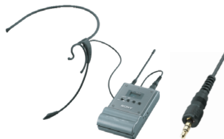
ECM-322BMP with bodypack transmitter included in the UWP-C1/S1/X1 package