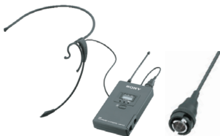
ECM-322BC with WRT-822B

ECM-322BMP : Supplied with a 3-pole locking mini plug for use with the bodypack transmitter included in UWP series