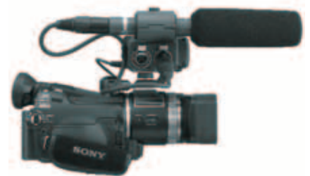
The ECM-673 attached to a Sony HVR-A1 Series camcorder

The built-in two-position (M, V) low-cut switch on the ECM-673 provides a simple method of reducing the effects of unwanted ambient noise.