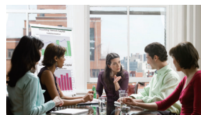
With View-DR function