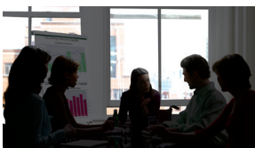
Without View-DR function

In addition, outstanding View-DR™ technology expands the dynamic range for clear images under harsh backlighting with extremes of light and dark in the same scene. XDNR™ technology reduces image noise for crisp reproduction of still and moving objects in poorly illuminated rooms.