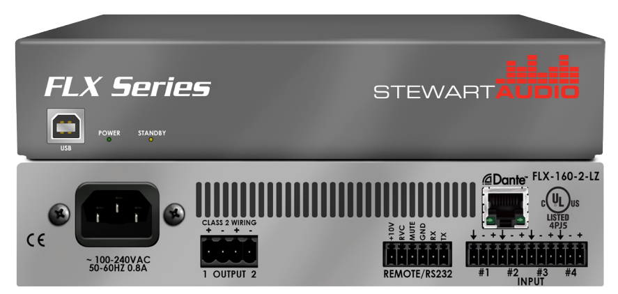
FLX 160-2-CV-D shown

The FLX Platform is the most versatile 1/2 rack networked amplifier Stewart has ever produced. This compact package contains over 300 watts of power output in various channel configurations and impedances. At the heart of the platform is a robust, internal full function DSP that is designed to solve a multitude of your audio problems in just one box. The channel count varies from 1-4 channels and the DSP allows further configuration via routing, EQ, filters, limiters and much more. A USB port makes programing simple, fast and repeatable for large installations. The RVC and RS-232 control allow volume control from a wide range of devices. In addition, the FLX platform has an optional factory installed Dante™ card with 4 channels of networked audio in and out. You won't find a more flexible combination of power output and processing in a comparable package on the market today.