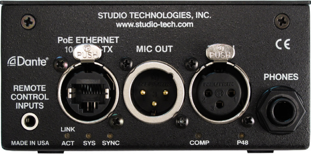
Figure 1. Model 206 Announcer's Console front and rear views