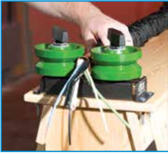
1. Gather Slewing on Fixture