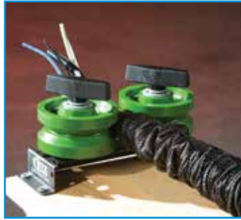
3. Set-Up Pulleys