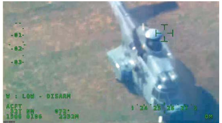
H.265 / HEVC - 1080p @ 1.5Mbps