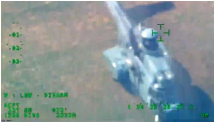
H.264 / AVC - 1080p @ 1.5Mbps