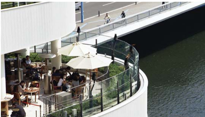
H.264 / AVC - 1080p @ 6Mbps