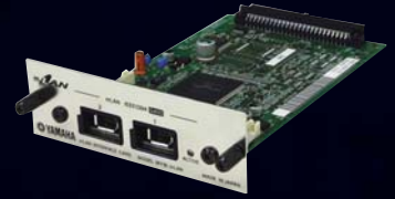
MY16-mLAN 16 channel m-LAN Interface Card