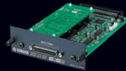
MY8-AE96 8 channel AES/EBU format I/O