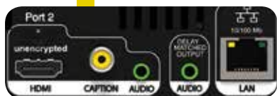
ZvPro800 Rear Detail