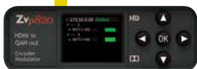
ZvPro800 Front Detail