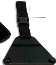
Suspension crown w/strap