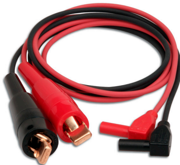
LSC-MBTLA2 (standard on MBT-LA2)