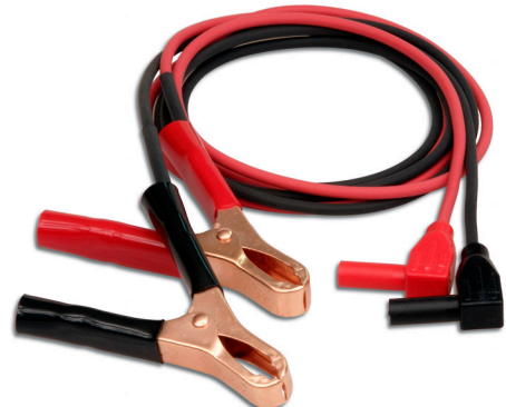
LSP-MBTLA2 (ideal for large batteries)