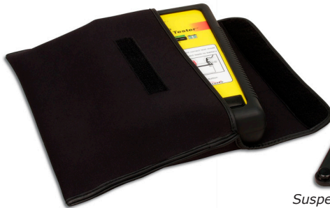
Soft case (tester not included)